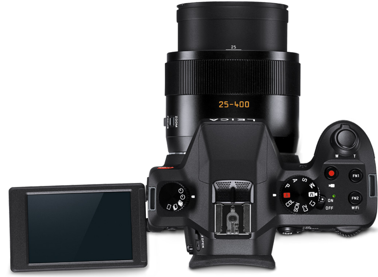
Not illustrated at full size.