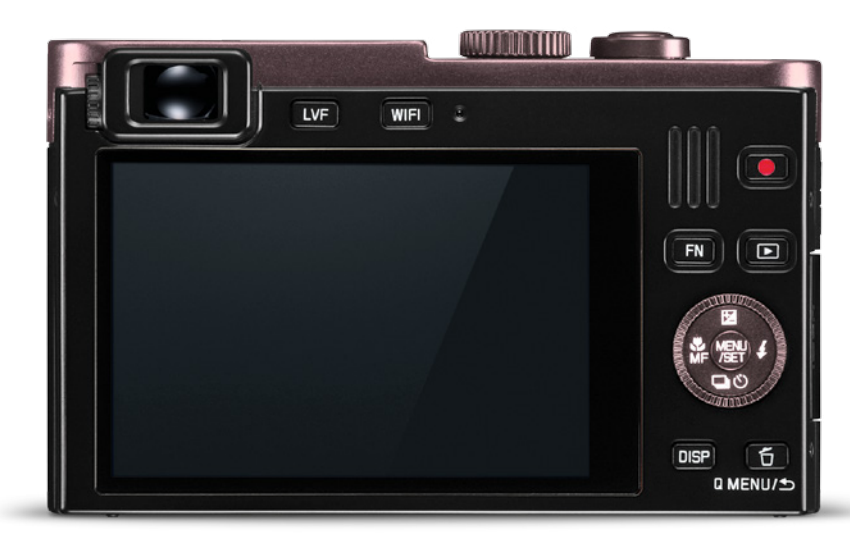
Full-size view, the camera is available in light gold and dark red.